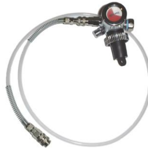
F3002 High Pressure Regulator Up to 300 bar (Included as standard with the F6001).