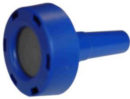
8103530 Draeger Oil Impactor